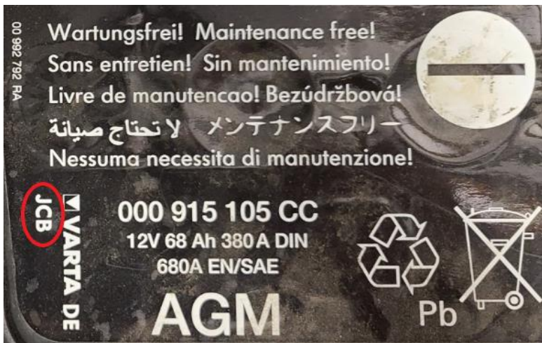
Figure 2: Example of the manufacturer/vendor code on the battery label.