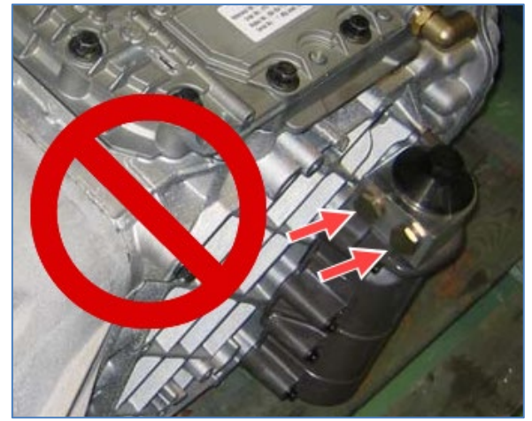
Figure 5: DO NOT BLOCK THE CONNECTION PORTS AT THE TOP OF THE OIL FILTER HOUSING