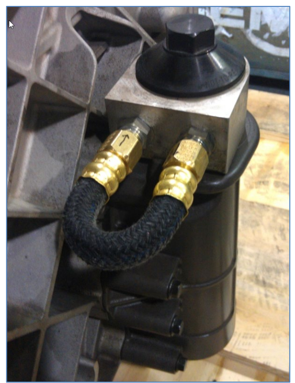
FIGURE 4: VOLVO 9700 - OIL CIRCULATION LOOP