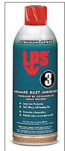
Figure 1 — Lubricant

This repair is not covered under the Altec Warranty Policy. Call 1-877-GO ALTEC (1-877-462-5832) to schedule the work to be done by an Altec service technician.