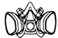
Example of a NIOSH-approved respirator