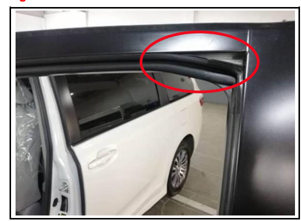
Figure 1. Front Door Glass Run Failure