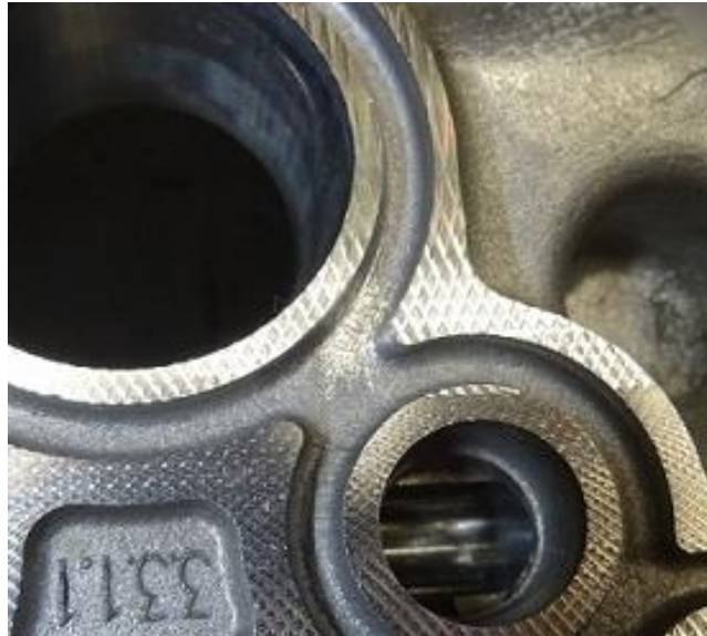
Figure 6. After the repair.