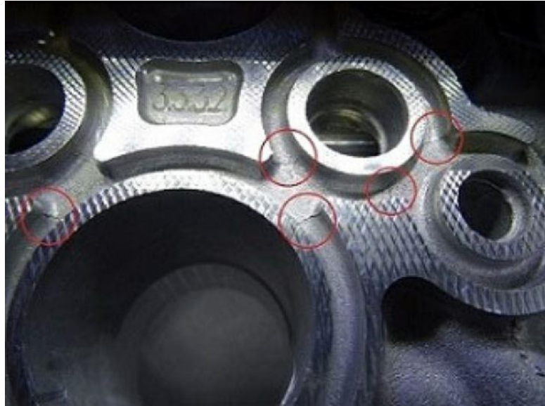
Figure 5. Before the repair.

Make sure not to damage the seal groove!