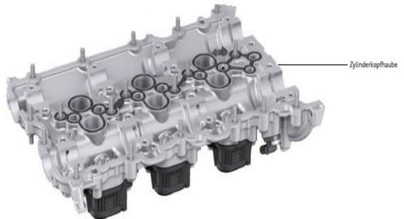
Figure 4. Remove the cylinder head cover and gasket.