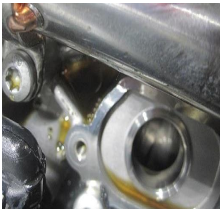
Figure 2. Oil in the Audi valve lift system.