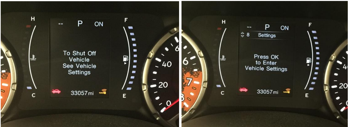
Step 1: Using the EVIC Controls, enter to the “Settings” Menu

Note: Ensure the vehicle is parked in a safe location which is accessible by a tow vehicle. The vehicle WILL NOT RESTART after performing this procedure unless the fault is cleared or the battery is disconnected