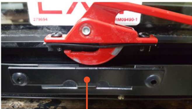
Scissor latch catch current