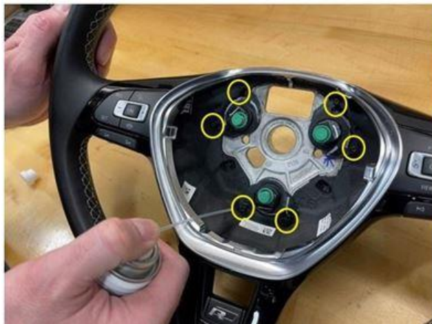
Figure 4: Lubricate spring packs

The -J527- must be engaged in the column slots, NOT resting on top of the slots. If the Steering Column Electronics Control Module -J527- is improperly seated, reinstall the -J527-. See repair manual group 94 in Elsa. Install upper steering column cover.