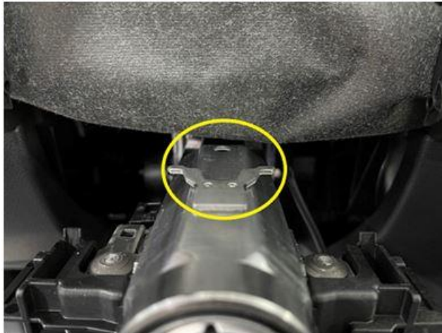
Figure 3: Switch retaining tabs on column

The -J527- must be engaged in the column slots, NOT resting on top of the slots. If the Steering Column Electronics Control Module -J527- is improperly seated, reinstall the -J527-. See repair manual group 94 in Elsa. Install upper steering column cover.