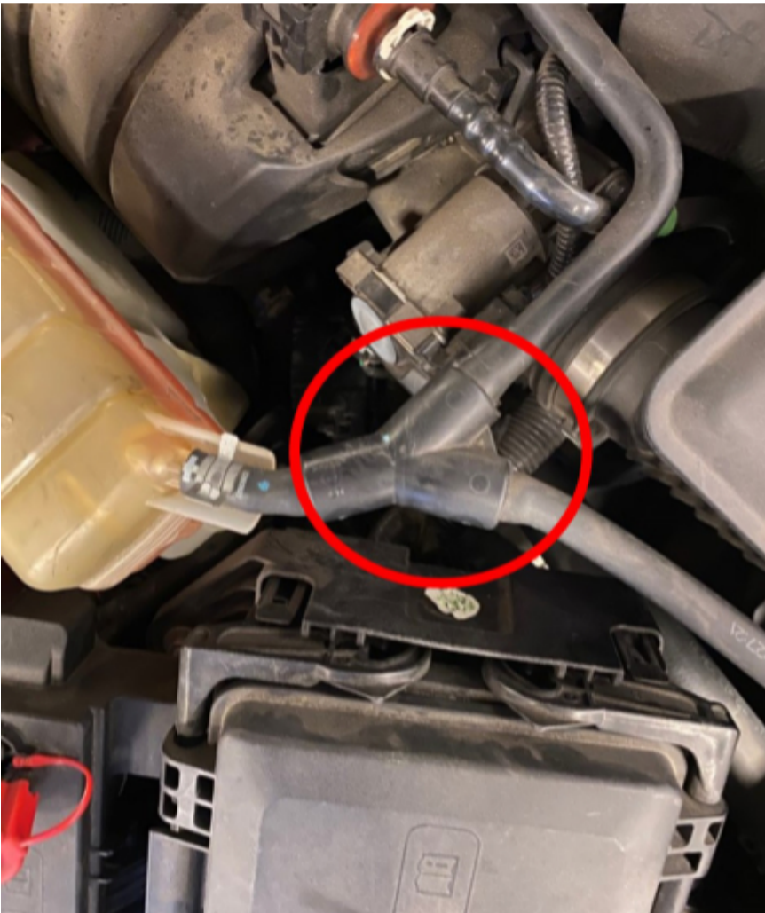
Coolant "Y" Hose Leak