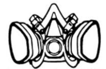
Example of a NIOSH-approved respirator