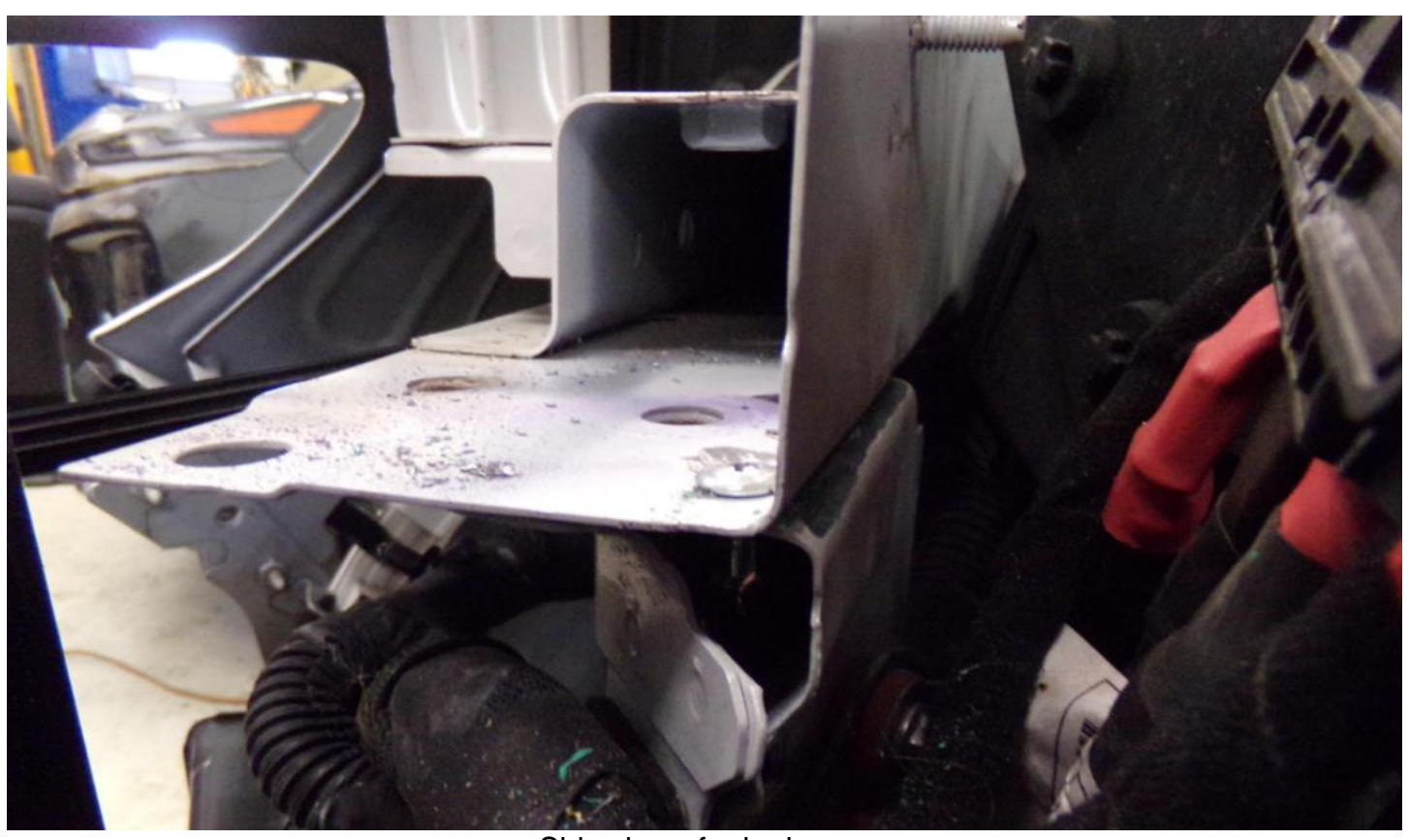
Side view of prior image

This document does not authorize warranty repairs. This communication documents a record of past experiences. STAR Online does not provide any conclusions about what is wrong with the vehicle. Rather, it captures all previous cases known that appear to be similar or related to the vehicle symptom / condition. You are the expert, and you are responsible for deciding on the appropriate course of action.