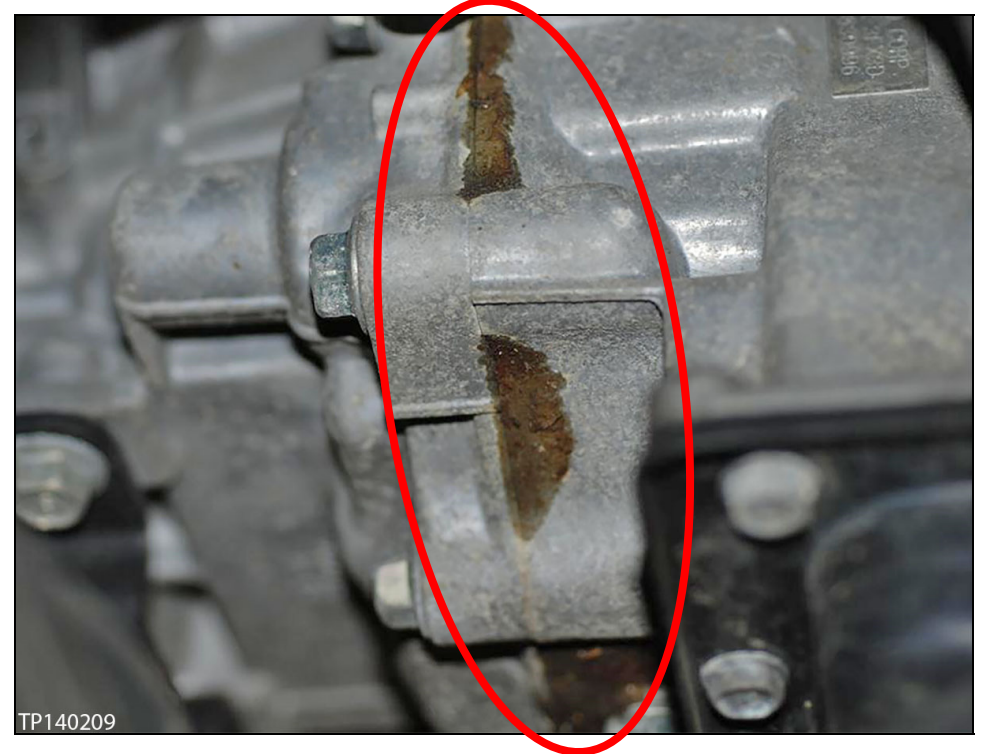
Transmission case halves area