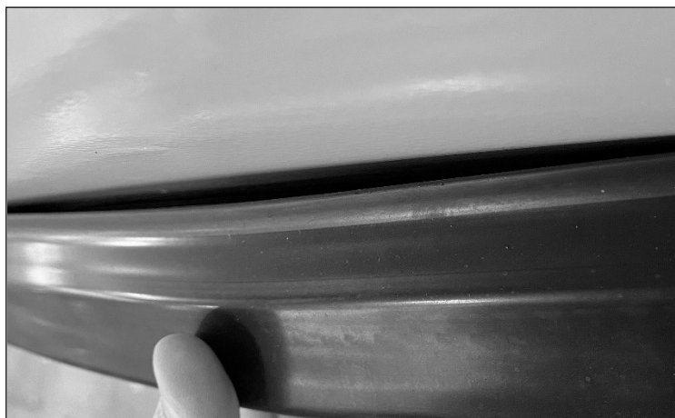
Figure 2 — Fender Rubber Separation