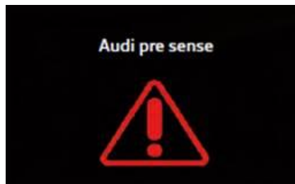
Figure 1. Audi pre sense symbol.

The Audi pre sense symbol appears in the instrument cluster and an audible warning is issued at the same time (Figure 1). At the same time, neither of the blinkers was active nor the side window closed.