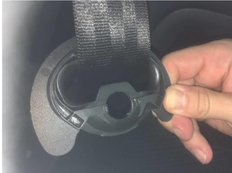
Figure 4. Old seat belt guide removed. Seat belt twist corrected.