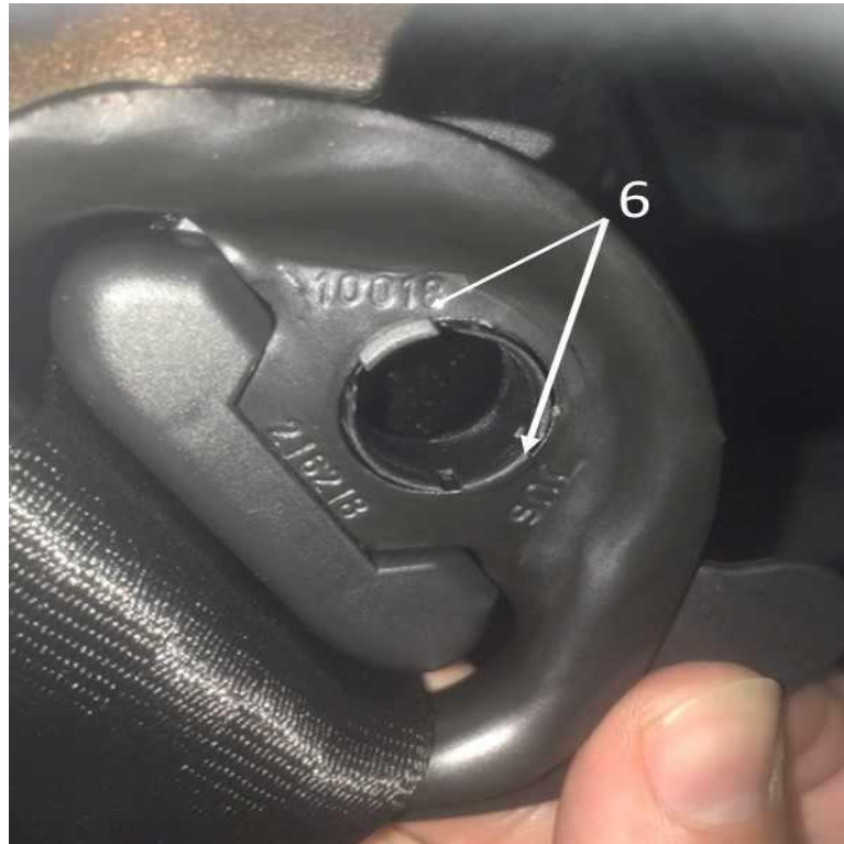
Figure 7. Belt guide locking tabs correctly secured at bolt hole.