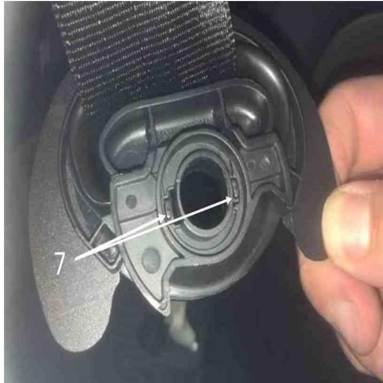
Figure 8. Seat belt deflector trim locking tabs properly secured to seat belt guide.