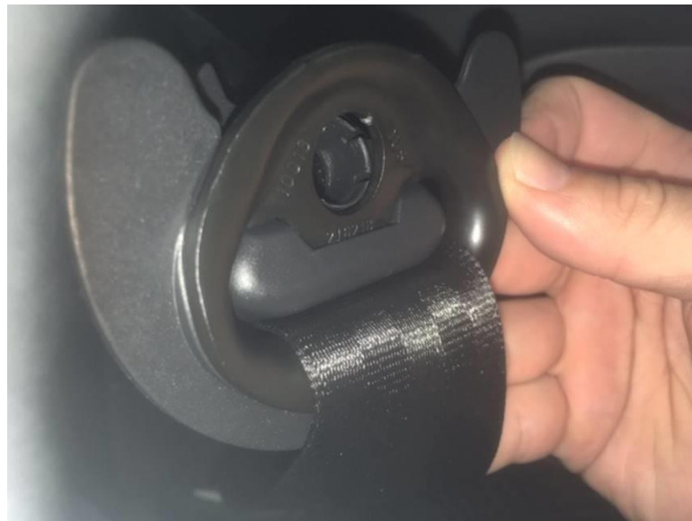
Figure 3. Removing old seat belt guide starting at the bolt hole.