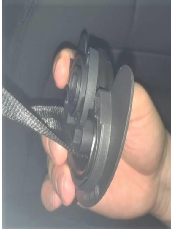
Figure 6. Seat belt deflector with new guide installed.