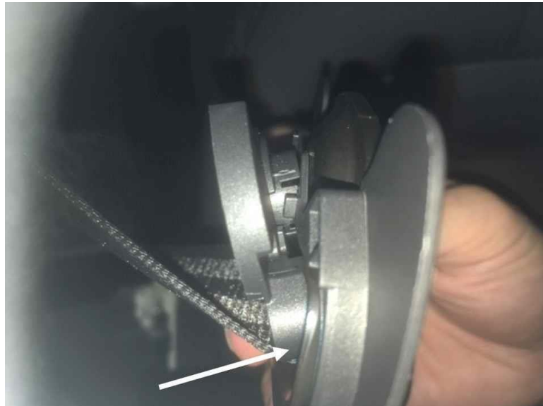
Figure 5. Installing modified seat belt guide starting with the metal tab on the bottom.