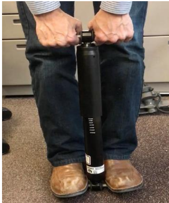
Fig 2 Damper Priming

Prior to installation the damper needs to be purged with the ROD END UP and Body down. Using long screw drivers or bolts as handles prime the damper full strokes 5 times as shown in fig 2.