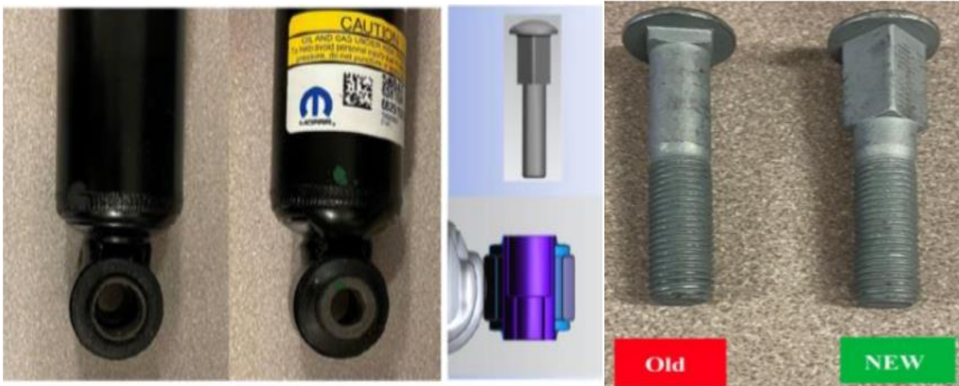
Fig 1 New mounting bushing and bolt design

Customer Complaint/Technician Observation: Steering Damper 68251580AF has updated mounting to ensure the damper goes on the correct direction (fig 1). The AF level damper requires a new outboard attachment bolt be installed that features a longer square shoulder 06513445AA (new in fig 1). As with past practice the bolt must be replaced every time the damper is serviced.