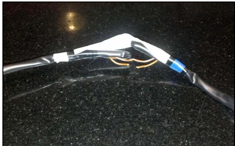
Close-up View of Damaged Harness

Additionally, wiring for the seat belt buckle switch, heated seat, and power seat motor (if equipped) are found in the same under-seat location as the harness for the driver's seat slide sensor.