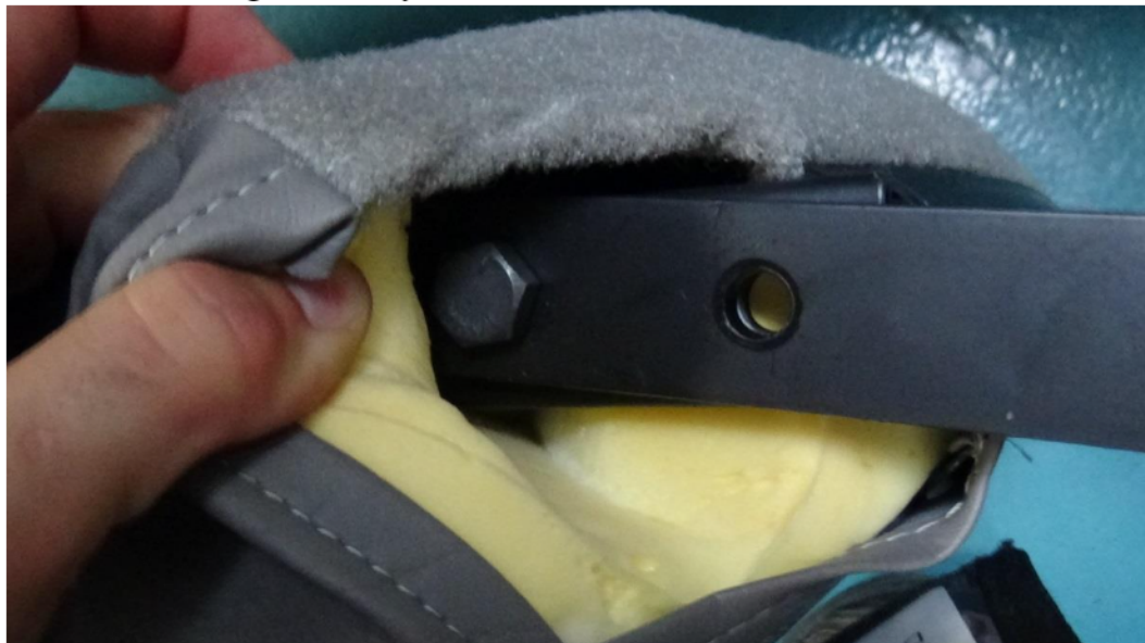
Figure 5: Right Hand Side Pivot Bolt