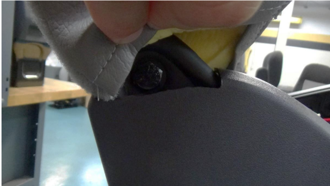
Figure 6: Frame Extender Bolt

Line up the new back rest with the lower frame and attach the bolt from Fig. 5, torquing it to 24\pm 2 ft-lb. thread the bolt from Fig. 4 into the back plate assembly. Next, insert the bolt and nut in the right hand side frame in Fig. 6; torque it to 12-20 ft-lb.