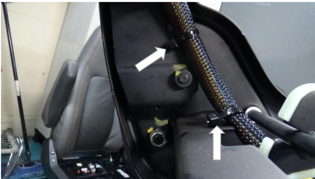
Figure 3: Cable Ties

To remove the seat back, remove the 9/16" bolt in Fig. 5 and the 9/16" bolt in Fig. 4 as well as the bolt on the right hand side in Fig. 6. Remove it using a 9/16"