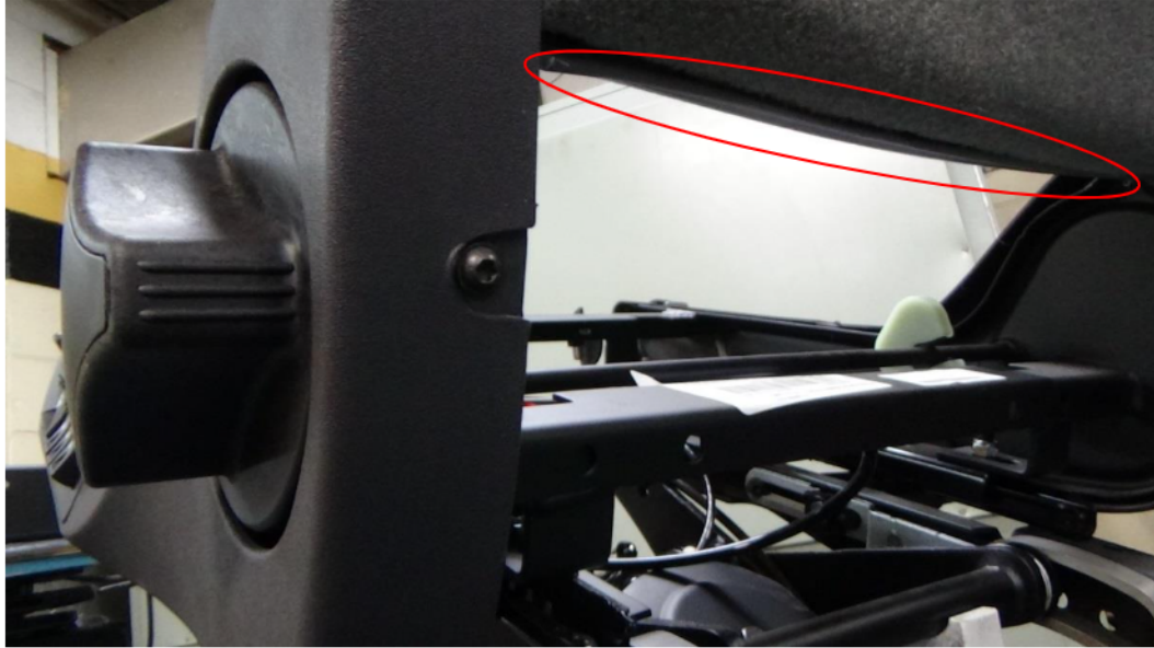
Figure 2: Back Rest J-Clip

Unclip the back rest j-clip in Fig. 2 by folding the front part forward until the entire piece disconnects.