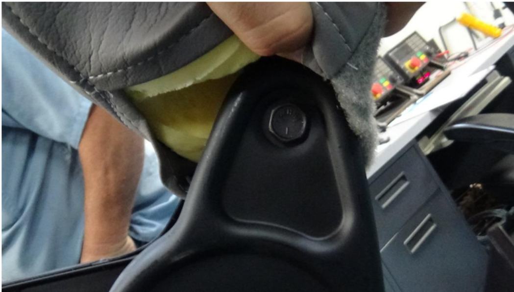
Figure 4: Left Hand Outside Pivot Bolt

wrench, holding the nut with a 9/16” wrench. The back rest will come off once that bolt is removed.