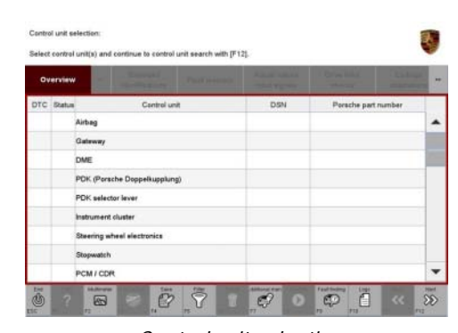
Control unit selection

5 Once you have erased the fault memories, select the ⇒ 'Overview' menu to return to the control unit selection screen ⇒ Control unit selection.