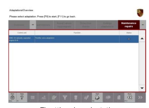
Throttle valve adaptation