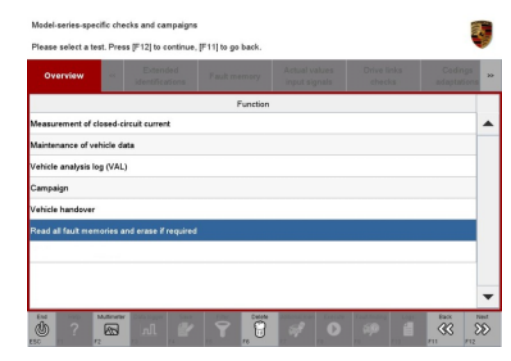
Erasing fault memories

The faults stored in the fault memories of the various control units are deleted.