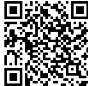
Figure 1. QR code for viewing the supporting video with a QR code reader on phones and tablets. Alternatively, the video can be accessed through computer internet browsers at the link provided in this bulletin.