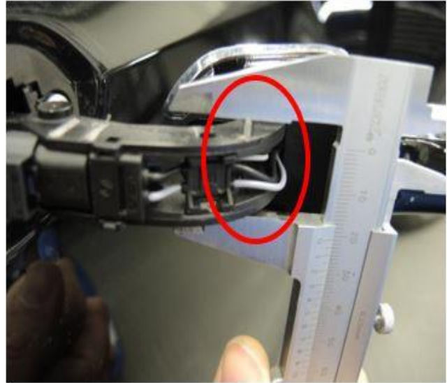
Figure 4. Measuring dimension of a door handle at rib #3.