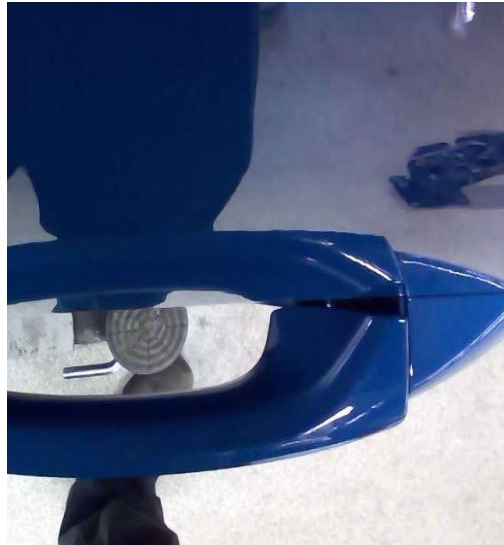
Figure 1. Door handle binding and not returning to zero position.