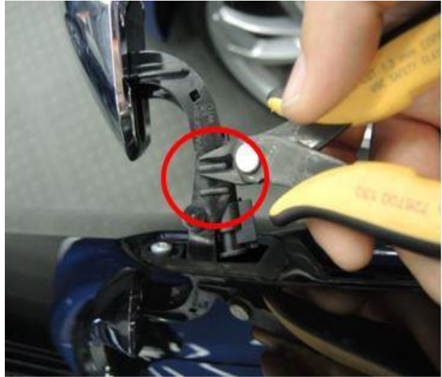
Figure 2. #1 and #2 door handle ribs prior to removal.