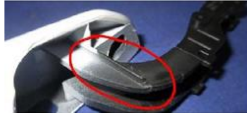
Figure 6. Top of rib #3 to be sanded down.