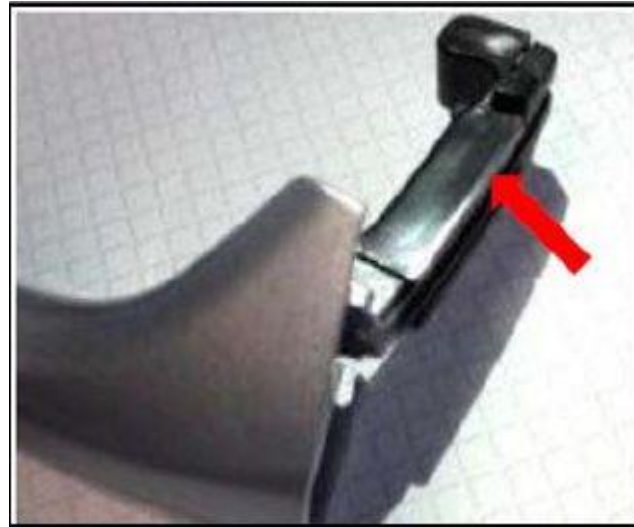
Figure 7. The door handle guide piece to be replaced.