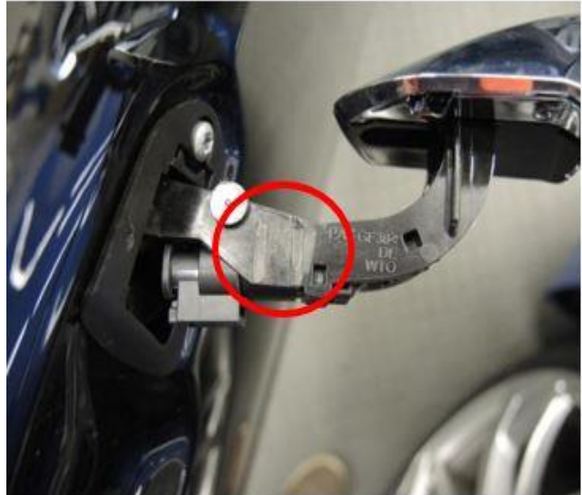
Figure 3. The door handle is shown with #1 and #2 ribs removed, leaving an even surface.