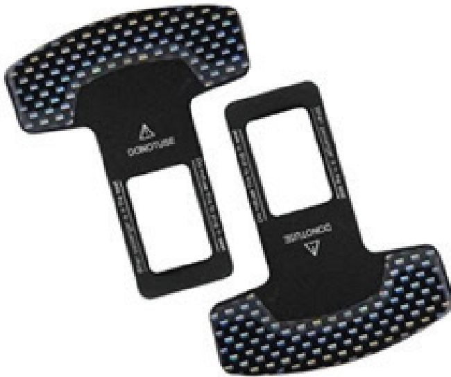
Figure 2: Example of dummy seat belt buckles