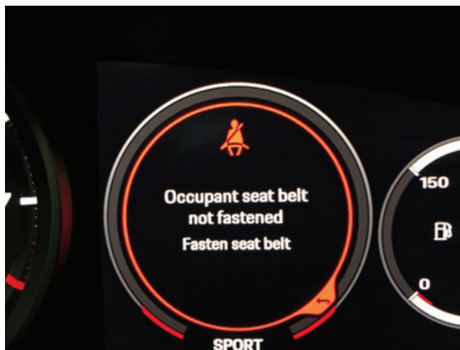
Figure 1: Red warning in the instrument cluster

The customer complains of a red warning message in the instrument cluster that reads, "Occupant seat belt not fastened. Fasten seat belt." This message appears despite all seat belts being fastened.