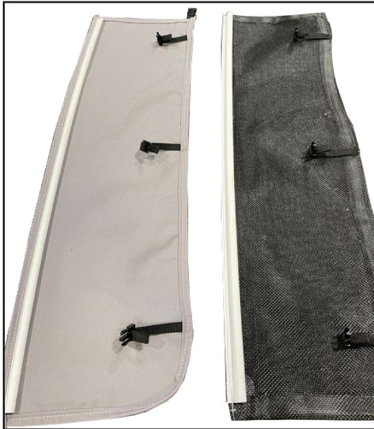
Current gray and new black panels.

The change will take place on a running basis, starting immediately. There is no price change. The current gray panels had right and left part numbers - 313881 and 313882. The new black mesh panel PN 2021097075 replaces both gray PNs. The top level patio rail kit number will not change.