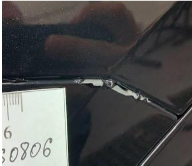
Figure 2. Paint peel on bumper cover edge.