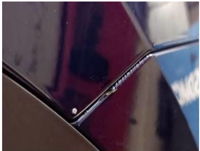
Figure 3. Early stages of peel.