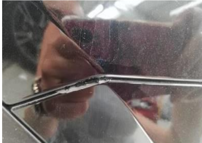
Figure 4. Moderate loss of adhesion.