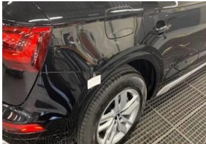
Figure 1. Bumper cover edge affected.