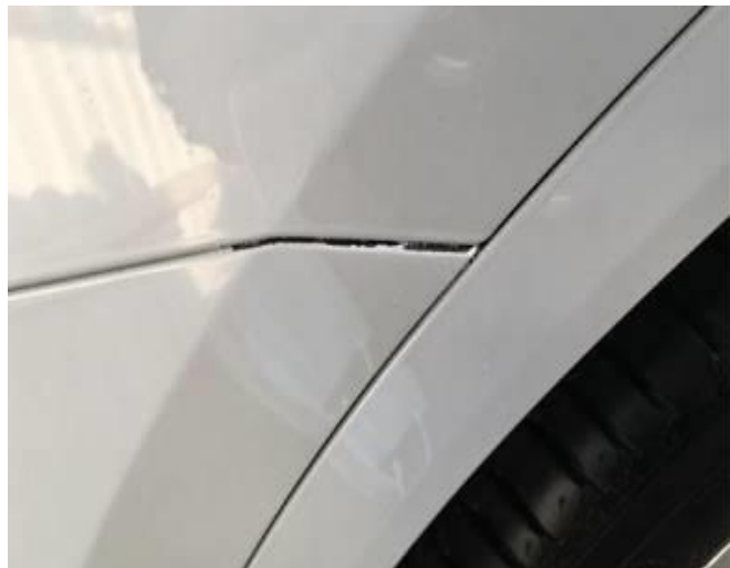
Figure 5. Advanced paint peel.