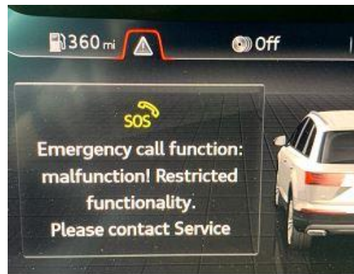
Figure 2. SOS warning in the instrument cluster.