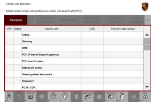
Control unit selection