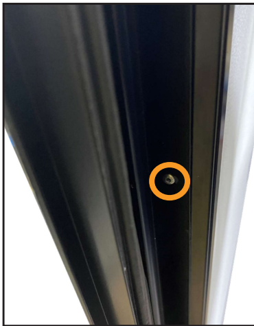
Current - Rivets

The part number for the current rivet is 255902. The part number for the screw is 338951. There is no change in fit, form, function, installation or operation with the hardware change. The change will begin on a running basis, starting immediately.