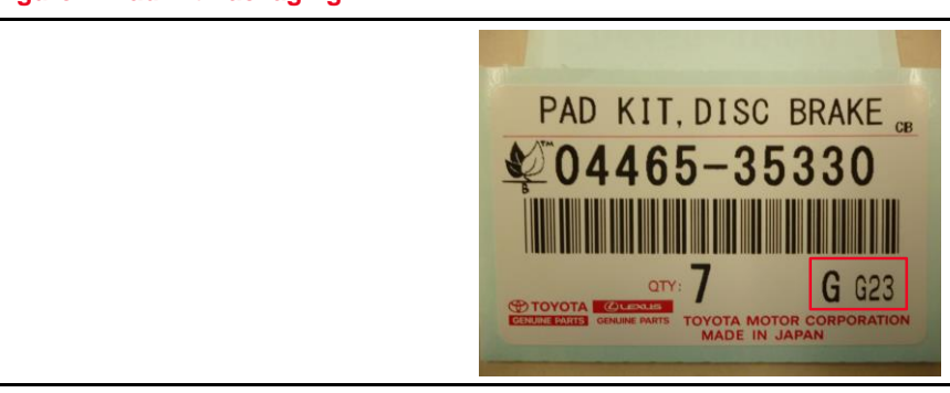
Figure 1. Pad Kit Packaging

For example: G23 - July 23^{rd} (G = July, 23 = 23^{rd} day of the month).