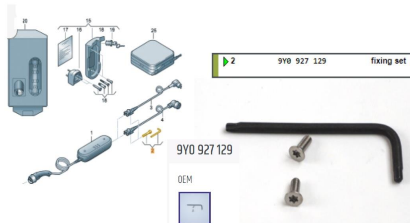
Figure 1. Bolts.

Bolts (part number 9Y0 927 129) for securing the connector in the charging unit have been discontinued (Figures 1 - 2).