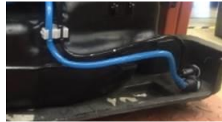
Figure 1. Lines in the tank.

Make sure there is now sufficient spacing between the fuel lines.