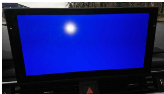
Figure 2. Single screen vehicle.