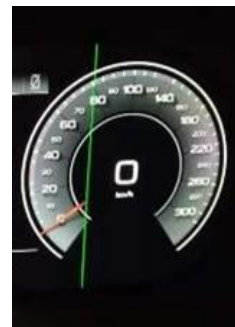
Figure 1. Vertical line through the instrument cluster display.