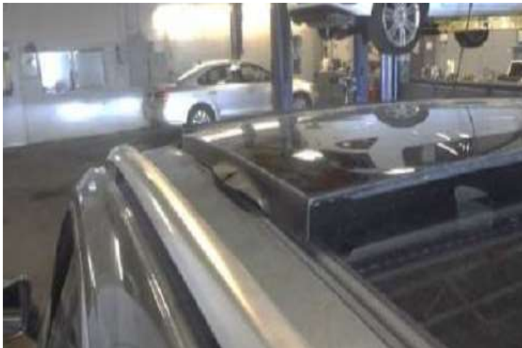
Figure 3: Example of the sunroof panel molded seal warped/deformation.