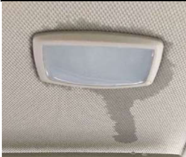
Figure 1: Example of water leak coming from the front vanity light.