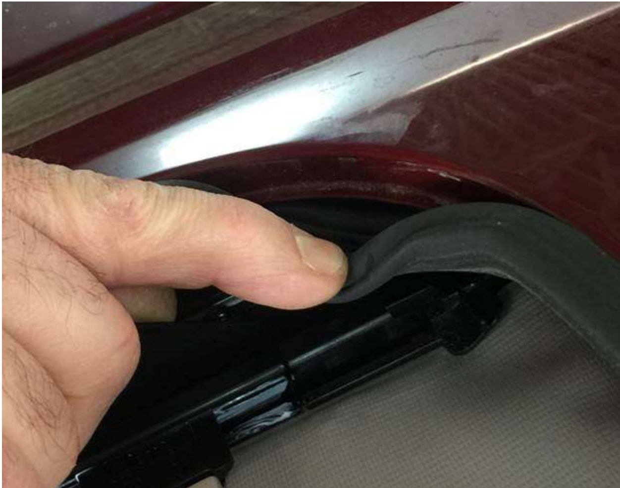
Figure 4: Example of a adhesion issue photo for uploading into WISE.

Take photos of the seal and body sections that were not adhered to the body and upload to WISE for a valid warranty claim.