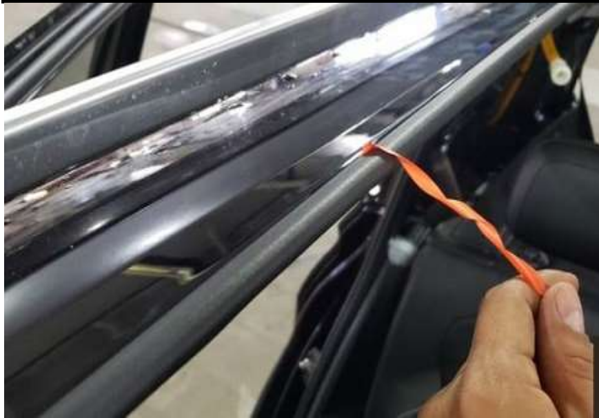
Figure 6: Example of removing the “red” protective tape after seal has been properly seated.