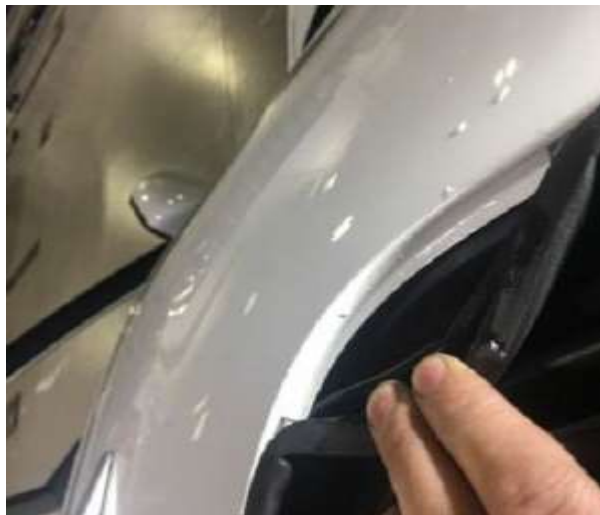
Figure 2: Example of the sunroof body side seal not having proper adhesion to the body.