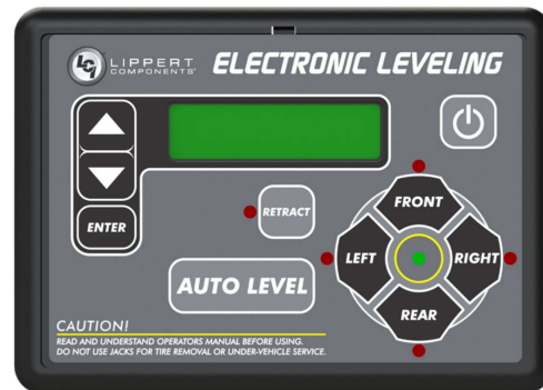
New LCD Touch Pad