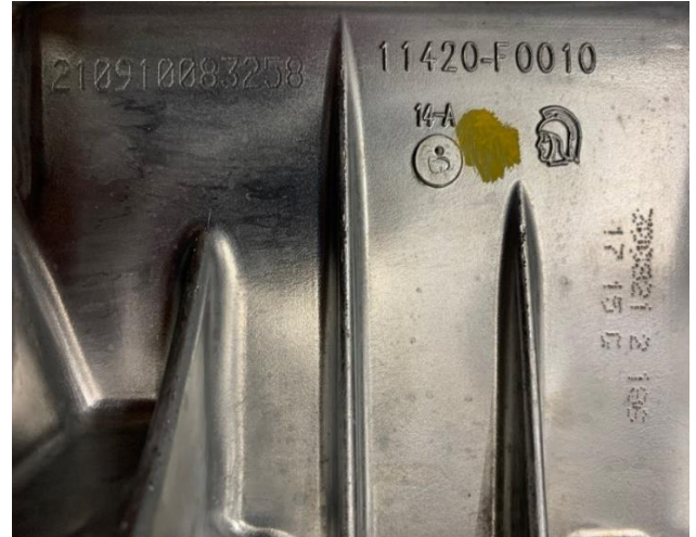
Crankcase identifier information