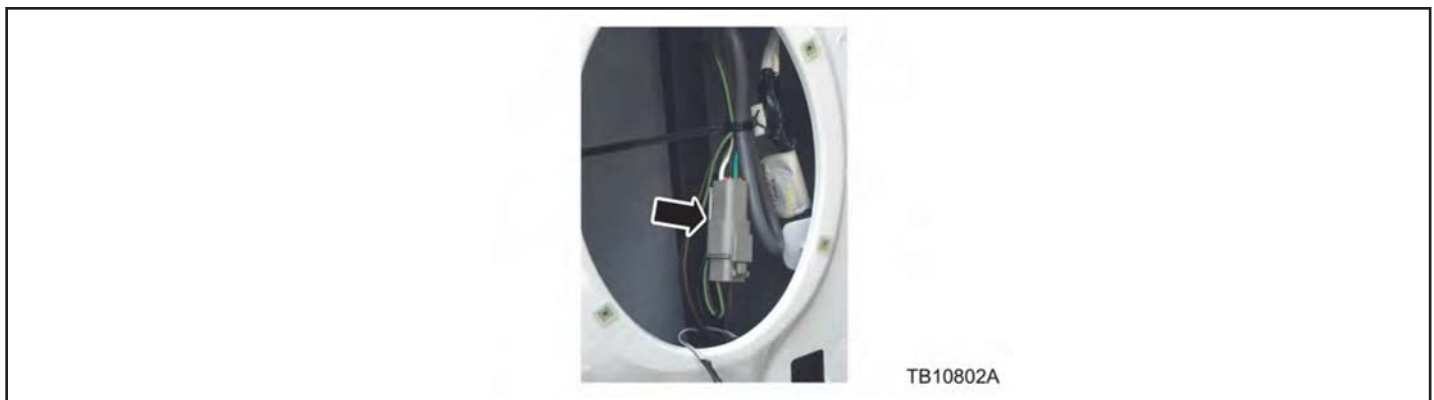
Figure 3 - Article 15-0164