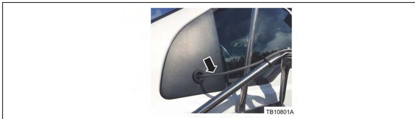
Figure 2 - Article 15-0164