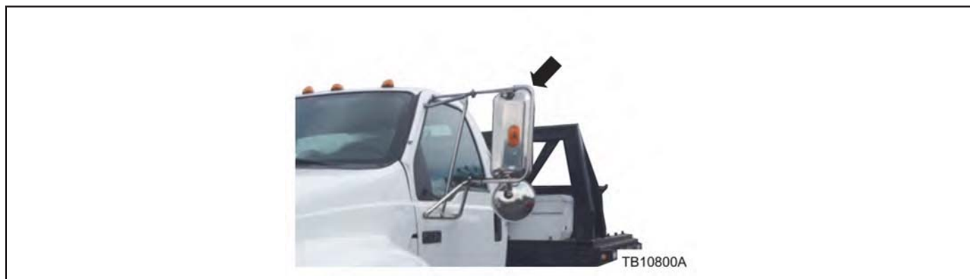
Figure 1 - Article 15-0164