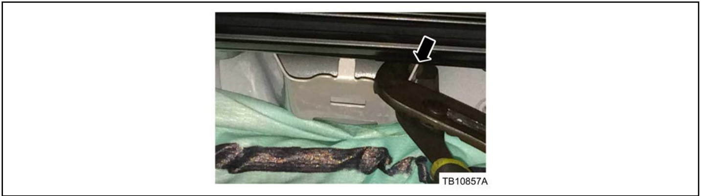
Figure 3 - Article 16-0053