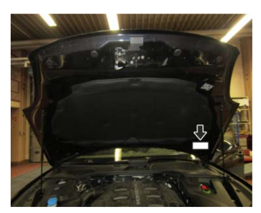
Proof of Completion Label: specified position (Exemplary illustration — 911 (991), Boxster/ Cayman (981) position accordingly)

A template of the proof of correction can be downloaded from PPN: https://ppn.porsche.com/portal/docs/DOC-387933