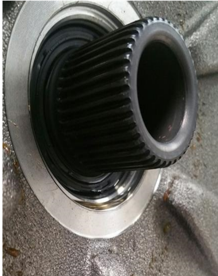
Figure 2. Oil leak at the input shaft.