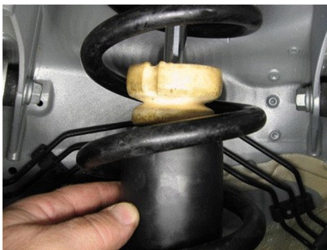
Figure 1. The shock absorbers are sitting incorrectly.