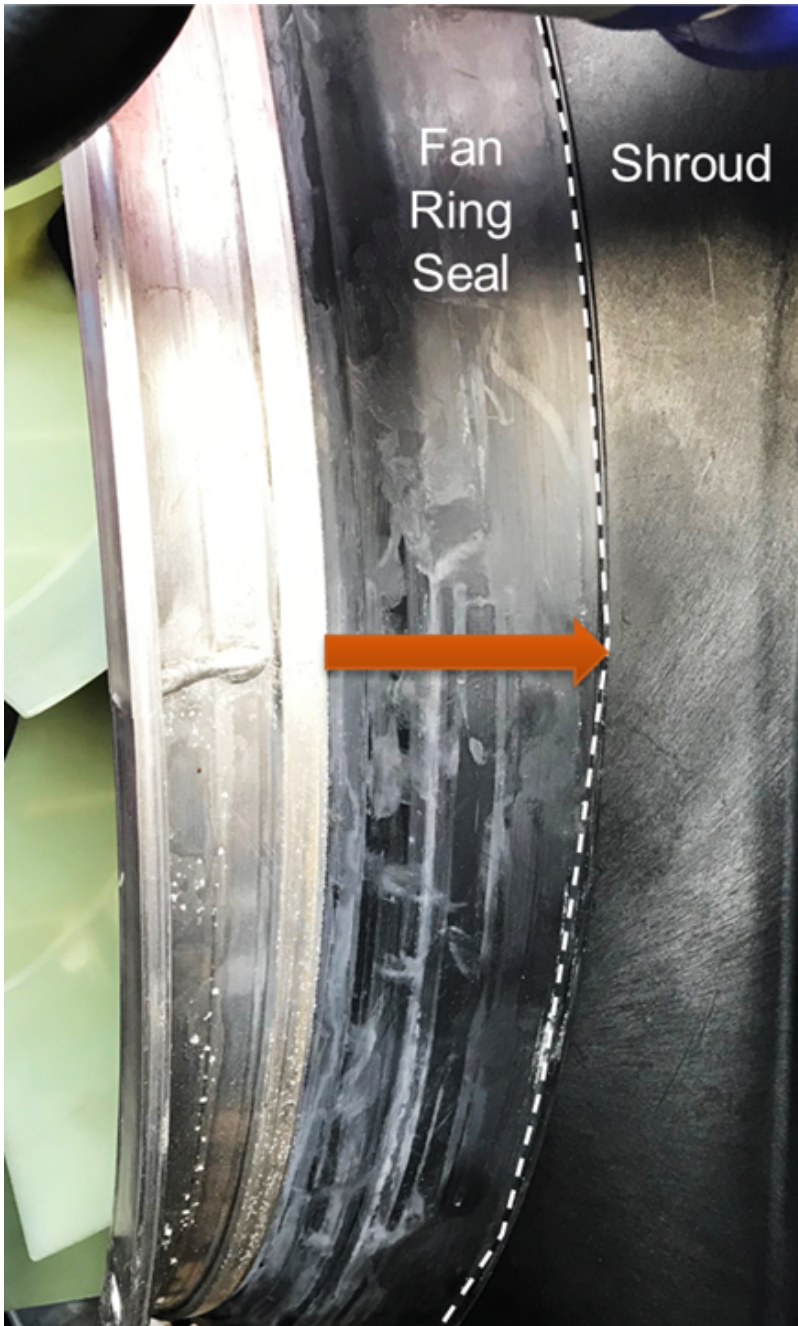
Correct - Fan Ring Seal sits on the outside of the shroud