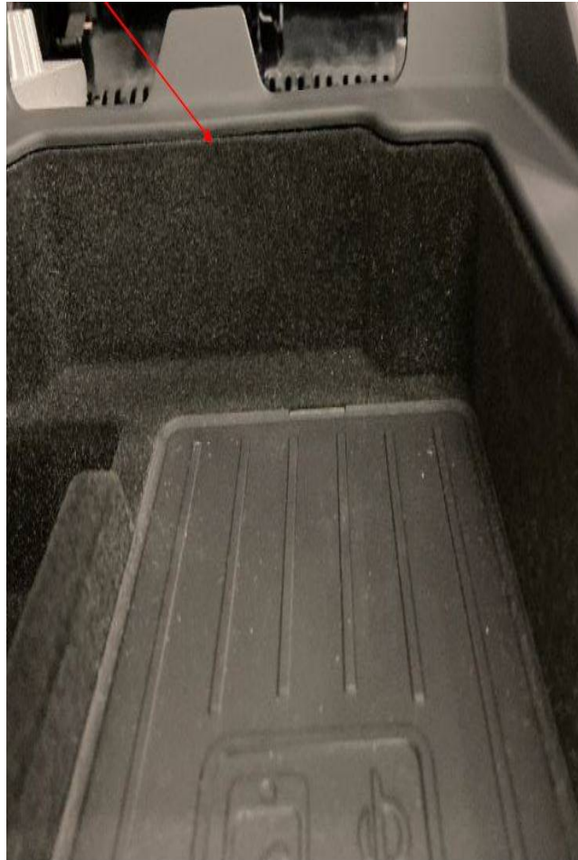
Figure 3. Center console upper section to storage bin gap, even and approx.0.5 mm wide.