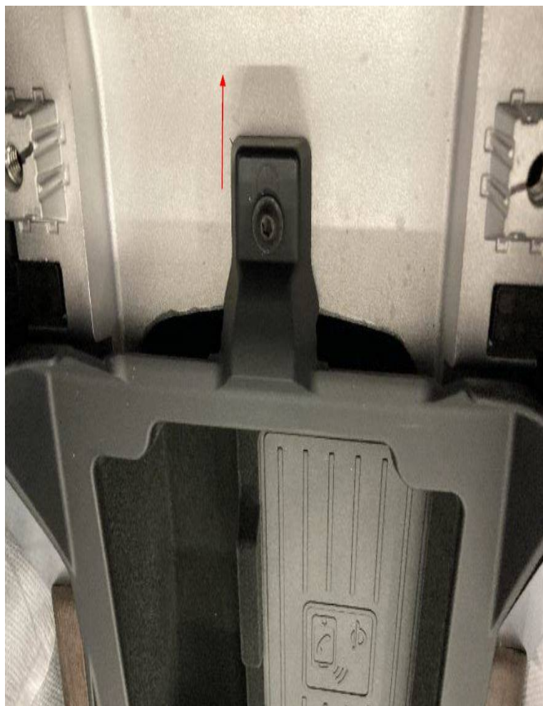
Figure 2. Moving the center console upper section towards the rear of the vehicle