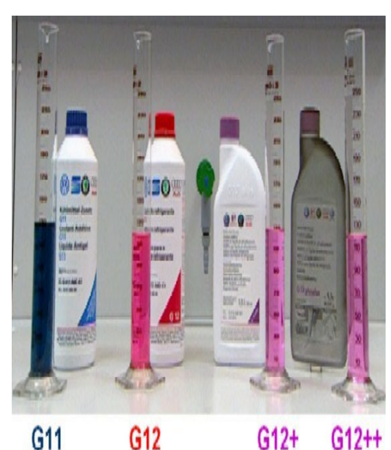
Figure 1. The color of each type of engine coolant. G11 (green-blue), G12 (red), G12+, G12++, G12evo, and G13 (purple).

Tip: Figure 1 is shown for color identification only; coolant packaging may vary.