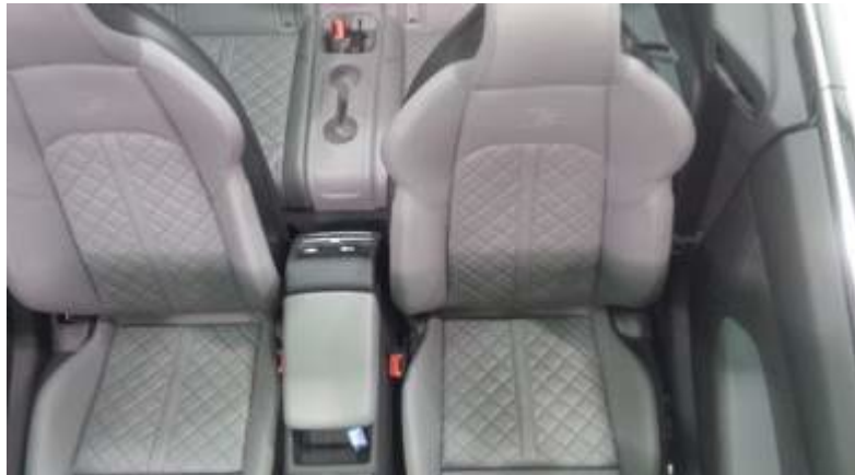
Figure 1. S Sport Seats, PR Code Q4Q in the S5 Cabriolet.

Only vehicles with S Sport Seats (PR Code Q4Q) are affected. The seatbelts function normally, only the seatbelt positioner is an issue (Figure 1).