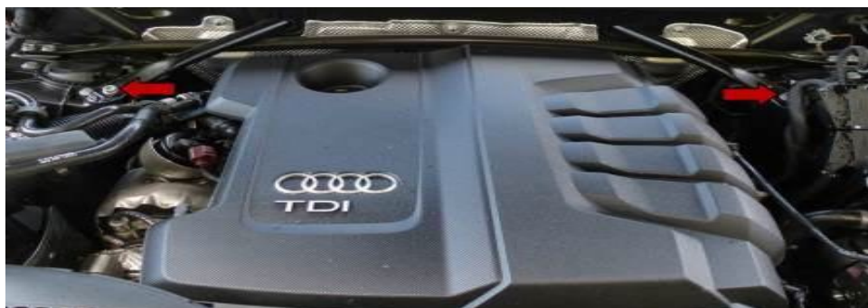
Figure 1. Example of tower brace for an Audi Q7.