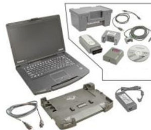
Diagnostic Tester -VAS6150X/VAS6160X- (or equivalent)