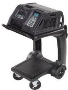
Battery Tester/Charger - GRX3000VAS- (or equivalent)