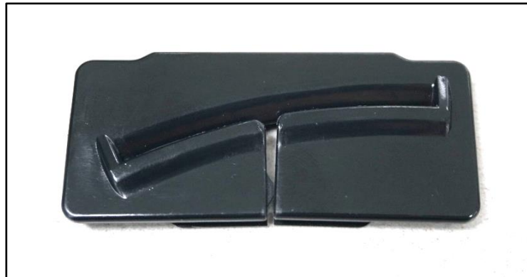
New 3 rd Row Center Seat Belt Webbing Guide

This bulletin provides information regarding the replacement of the 3rd row center seat belt retractor webbing guide associated with the 'Warranty Extension Program' (WTY024) on 2015-2018MY Sedona (YP) vehicles produced from July 21, 2014 through December 6, 2017. The 3rd row center seat belt in the affected vehicles may not fully retract into the headliner when being stowed, resulting in the seat belt dangling from the roof. When the 3rd row seat belt exhibits this condition, follow the procedure outlined in this publication to replace the 3rd row center seat belt webbing guide.