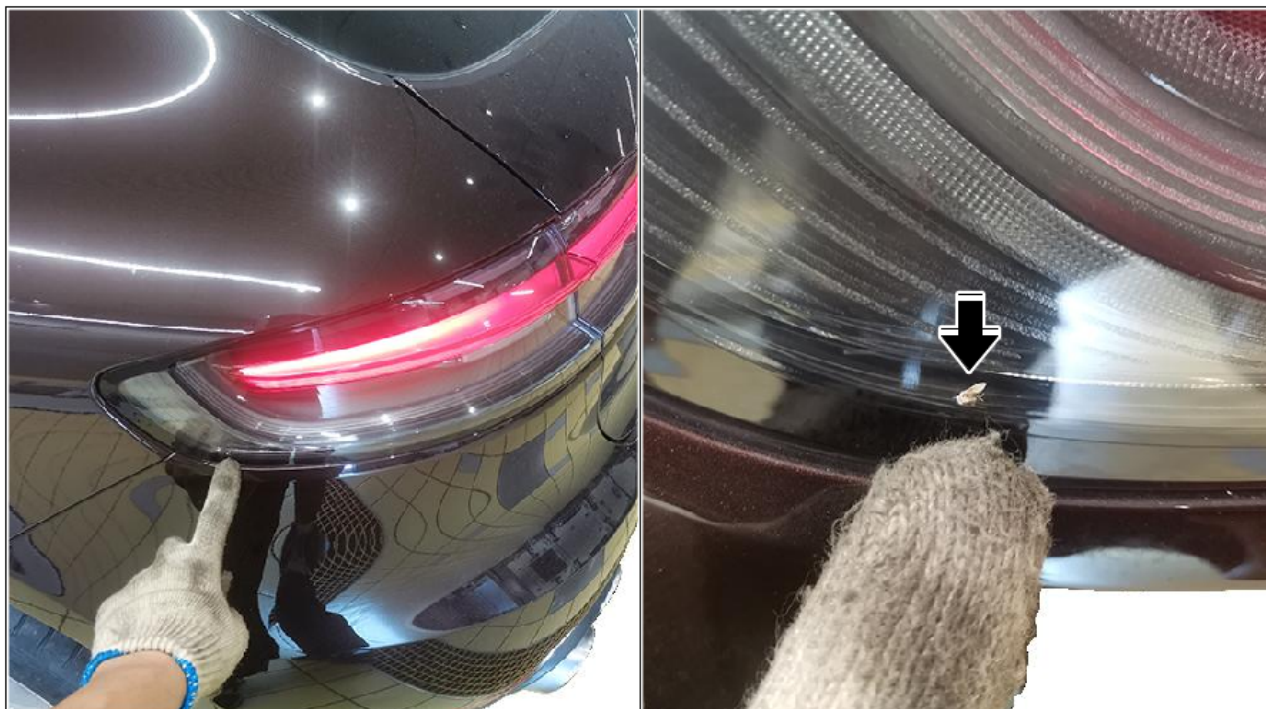
Insect ingress for tail light

Information: Due to the concept-related internal fogging behavior, insects can enter the inner tail light via corresponding openings in the body and tail light.