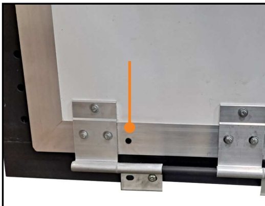
Left Weep Hole

There is no change in installation or operation with this product improvement. There is no price change and no part number change. The change will be made on a running basis in mid- to late-March.